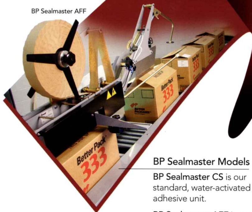
BP Sealmaster AFF

BP Sealmaster applies water-activated tape for a fast and secure seal. The unit reflects the rugged, reliable Better Packages tradition of the best in packaging equipment. The semiautomatic case sealer is extremely easy to operate, and delivers a secure seal to protect your carton's contents.